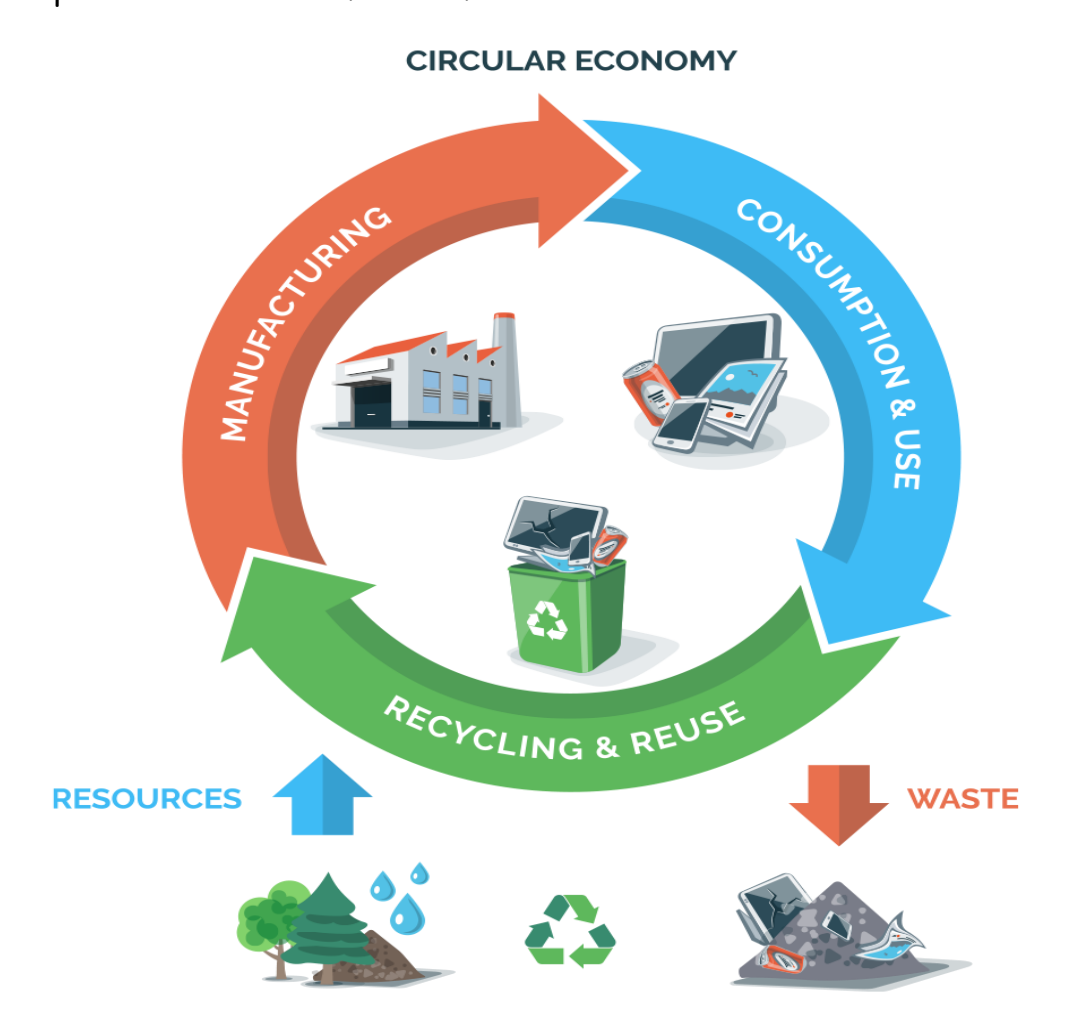
Recycle and Reuse of E_waste

The initiative was well-received and left a lasting impact on participants, encouraging them to adopt healthier habits for a safer and cleaner environment.