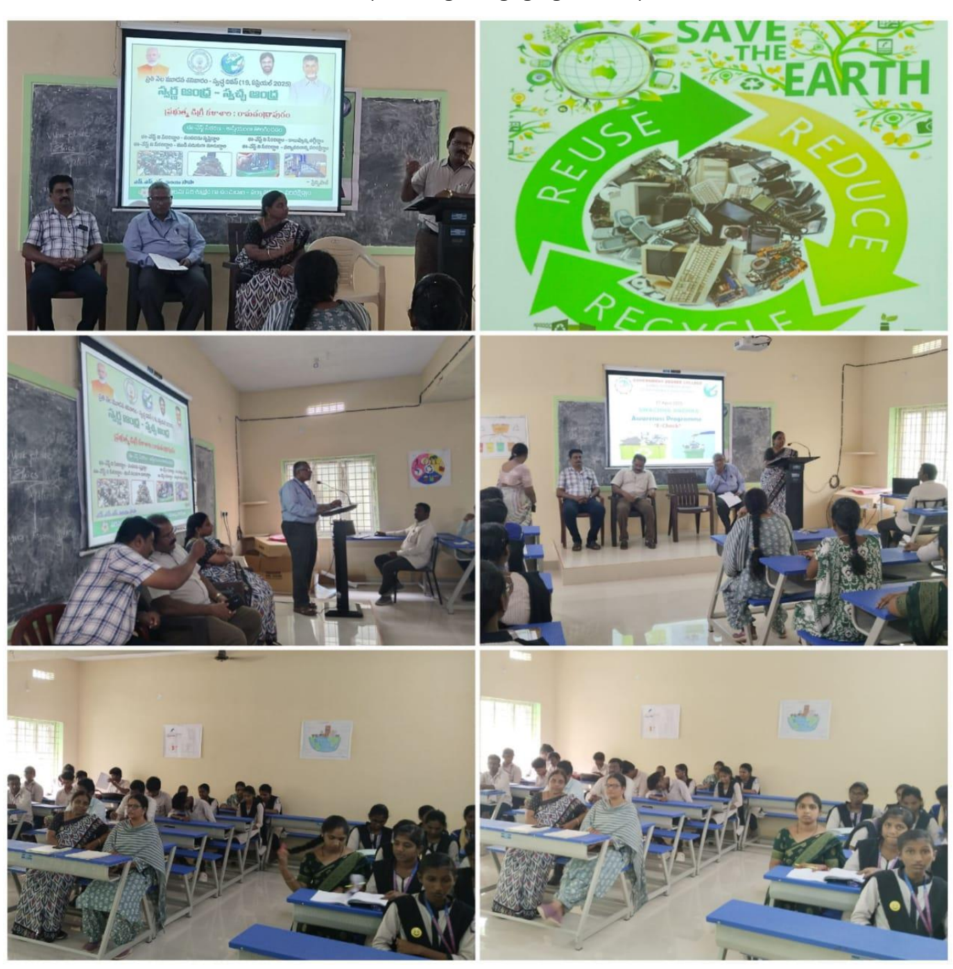
The Awareness Programme on 'E_waste' attended by the Staff & Students

Created awareness about E-waste and proper disposal reusable alternatives is a critical step toward environmental sustainability. We can play a significant role in educating students and the broader community through engaging and impactful activities.