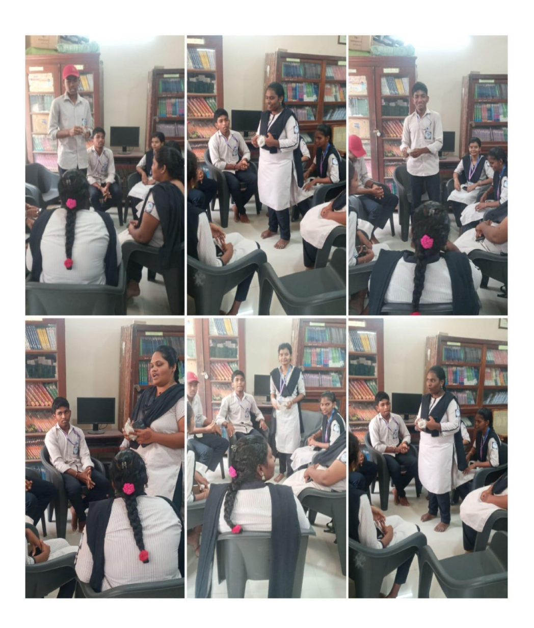
Group Discussion on 'E-waste' by the Students

A Group Discussion event aimed to create awareness on "E-Check", highlights the need to proper disposal of E-waste at its origin and explained the significance of proper Recycle of E_waste save earth and promote good health. The program witnessed active participation from students. After the Group Discussion programme the students were discussed on "E-Check", to the family members and created knowledge to the society about the disadvantages of proper disposal of E-waste.