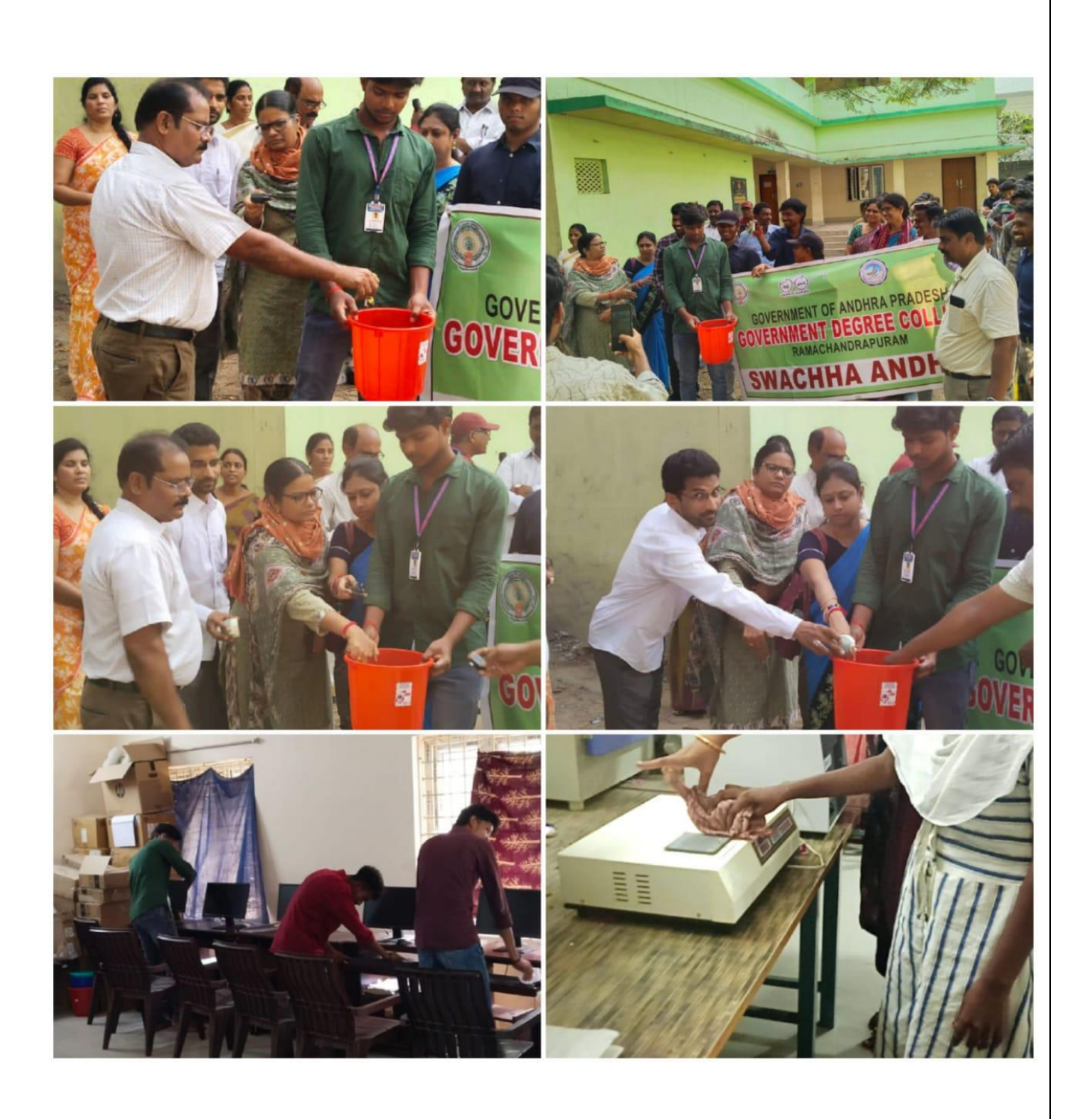
Campus clean up drive by Staff & Students

provided with gloves, face Masks brooms, dustbins, garbage bags, and cleaning materials to effectively remove and unwanted debris. Special attention was given to segregating E-waste into RED dustbin hazardous categories for proper disposal.