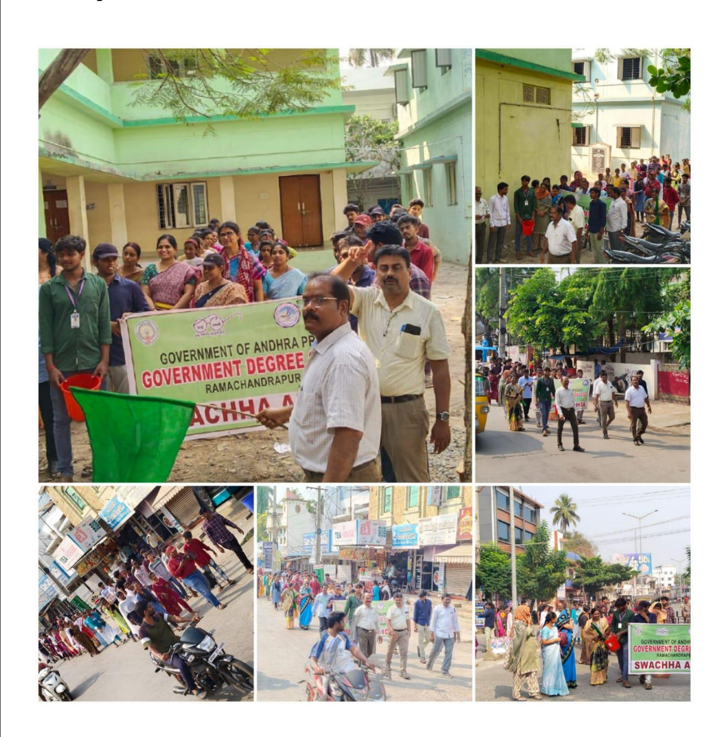
A 'Rally' on E-waste by Students & Staff

A Rally was organized on "E-waste" with slogans like "Recycle E-waste" "Clean Campus, Green Campus!" e-waste free Institute is a Healthy Institute!", and "Swachh Andhra, Swarna Andhra!" were displayed across the premises and outside the college.