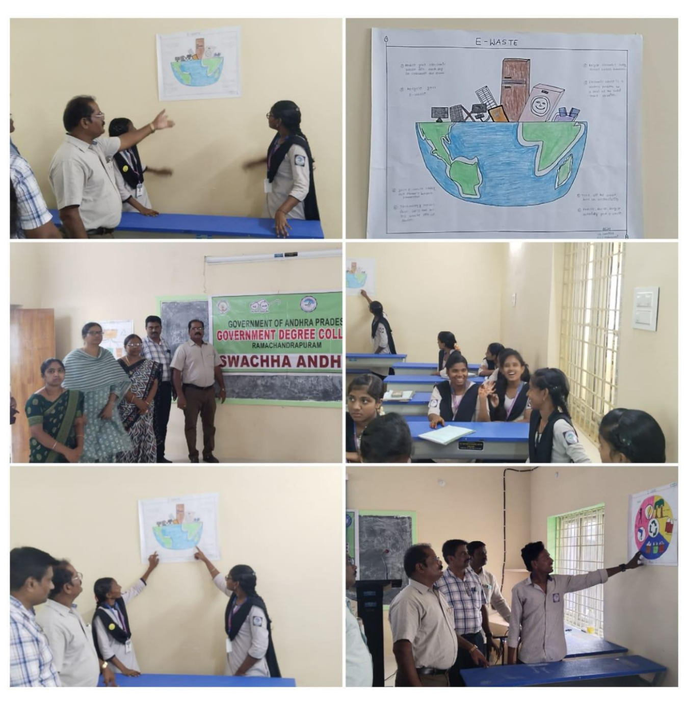
Poster prersentation on 'E_waste' by Students

This Poster Presentation program creates awareness to think proper recycle of E-waste. The unsustainable nature of generation and disposal of E-waste in a globalized world causes serious concerns for resource efficiency, human health and environmental impact. The loss of certain scarce resources can even impact future production chains and therefore technological innovation as we are missing appropriate substitutes..